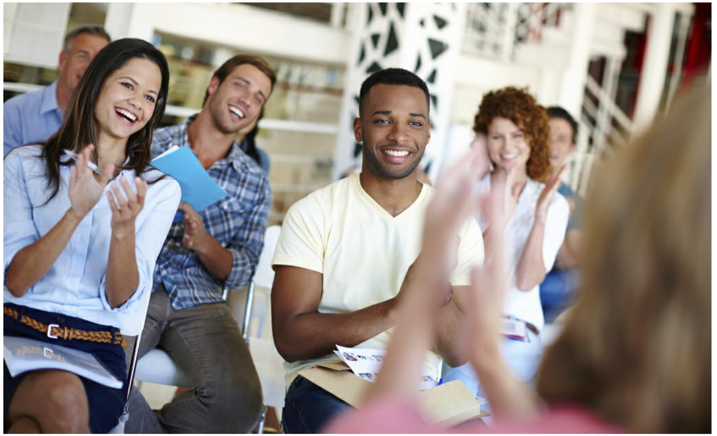
Aerobodies Coaching Programs